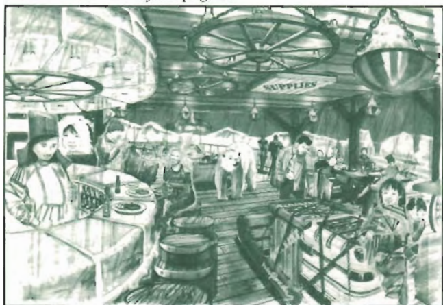
Arctic Kart Food & Beverage impression

tic and Aurora experiences. It comes complete with extensive food & beverage facilities, such as the "Explorer Restaurant", the "Igloo Bar" and the "Arctic Lounge."