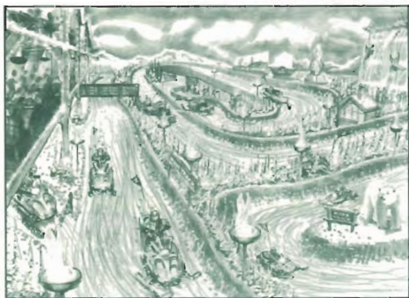
Arctic Kart hall day impression

The Arctic ® consists of two re-locatable instant structures shaped as giant igloos featuring several world premières. One stretched igloo called Arctic Kart ® features a patented indoor snow circuit. The other round igloo called Igloo SnowPlay ® features a total snow leisure experience for children. Because they provide instant fun, the two separate or combined igloos are perfectly suited for theme parks, water parks, family entertainment centres, ski resorts and large urban areas.