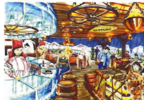
Impression of food & beverage facilities

In Arctic Kart consumers of all ages can experience for the first time the fun and sensation of riding real snowmobiles on a permanent real indoor snow circuit. Snowmobiling is a very popular sport and leisure activity, but has so far been the exclusive privilege mainly of people in North America and Scandinavia. The layout of the circuit with rounded curves, built-in hills and a fly-over has been co-designed by Helmut Holleis, importer of Arctic Cat snowmobiles. Special 4-stroke engines have been developed running on natural gas or liquid propane gas. As a special safety precaution a wireless remote control system is used to regulate the speed. Visitors have the choice between a great variety of activities ranging from snowmobiling, cross country skiing, dog sledding, ice-climbing, ice catving, an arctic motion theatre, snowmobile simulators, snow-related virtual reality games and edutainment involving Arctic and Aurora experiences. It comes complete with extensive food & beverage facilities, such as the Explorer Restaurant, the Igloo Bar and the Arctic Lounge.